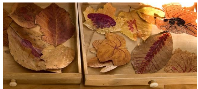
Ke-Sook Lee, Tree Woman (above), tree bark, fallen leaves, thread, mixed media; Tree Woman Leaf (below), fallen leaves, thread, mixed media.